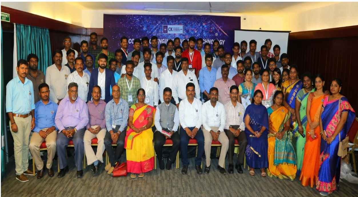
Grand Alumni Meet